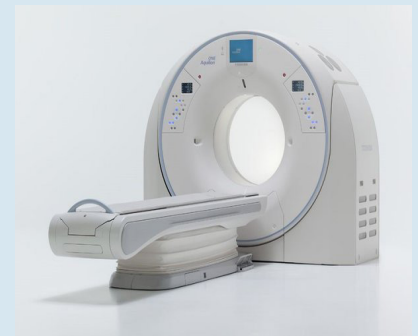
Toshiba Aquilion ONE Genesis Edition